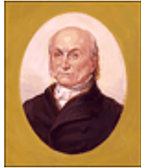
6. J Q ADAMS