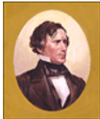
14. PIERCE 1