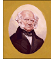
8. VAN BUREN