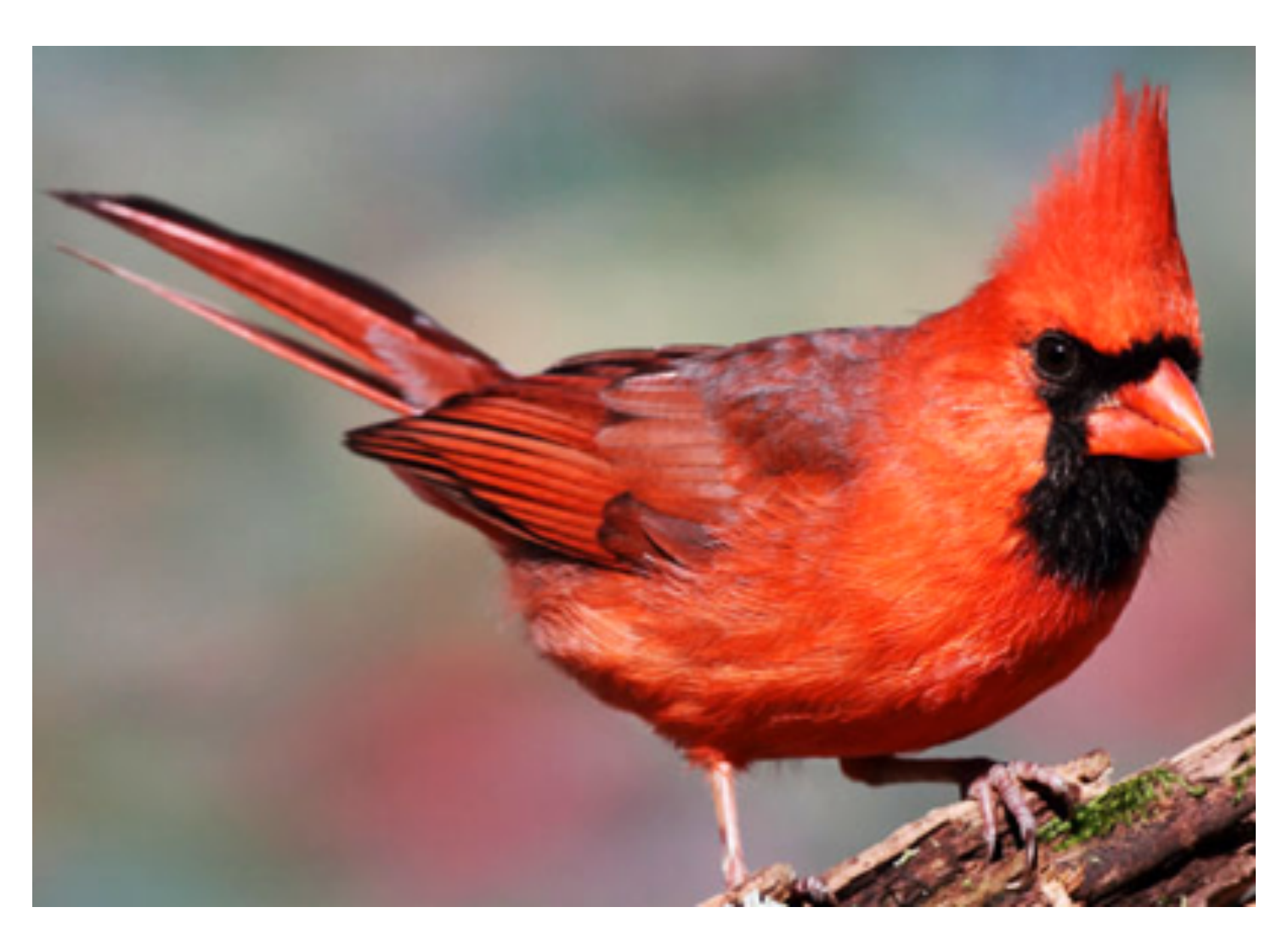
Cardinal State Bird of Illinois Indiana Kentucky Virginia West Virginia Ohio Nath Carolina

Male cardinals are brilliant red all over, with a reddish bill and a black face around the bill. Females are pale brown overall with warm reddish tinges in the wings, tail, and crest. They inhabit the eastern states. Cardinals don't migrate. so they're breathtaking in snowy backyards. In summer, their sweet whistles are one of the first sounds of the morning. Cardinals inhabit forest edges, backyards, parks, woodlots, and shrubby forest edges.